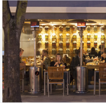
ROKA, 37 CHARLOTTE STREET, W1