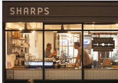
SHARPS, 9 WINDMILL STREET, W1