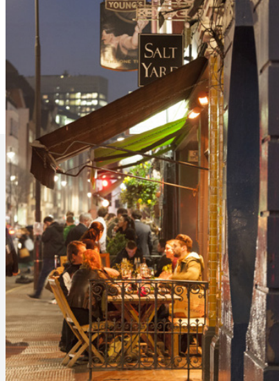
SALT YARD, 54 GOODGE STREET, W1