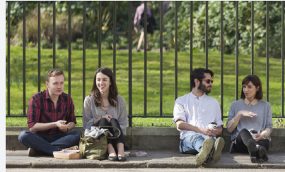
FITZROY SQUARE, W1

This historic artisan district brings its eclectic story to the fore with a mix of architectural styles, wide streets mingling with cosy side alleys and an abundance of hidden bar and restaurant gems.