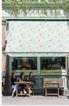
MR FOGGS, 48 NEWMAN STREET, W1