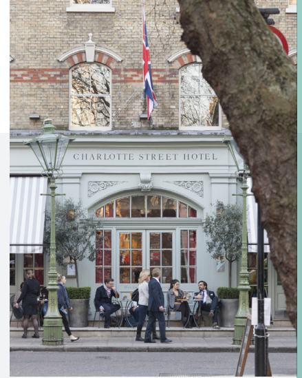
CHARLOTTE STREET HOTEL, 15-17 CHARLOTTE STREET, W1