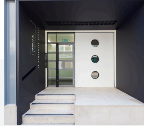
Charlotte Studios entrance

Behind it's bold façade lies 1,541 sq ft of Furnished + Flexible contemporary office space, thoughtfully designed with the occupier in mind. It's stylish, has plenty of natural light and adaptable layouts for easy and efficient occupation.