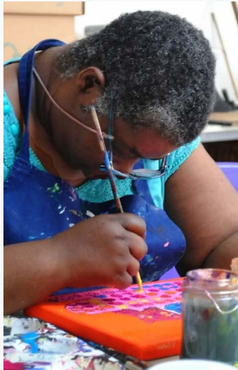
Tech Belt Community Fund recipient – Arts For All

In total in 2024, £112,206 was awarded to 16 projects across the two Funds.