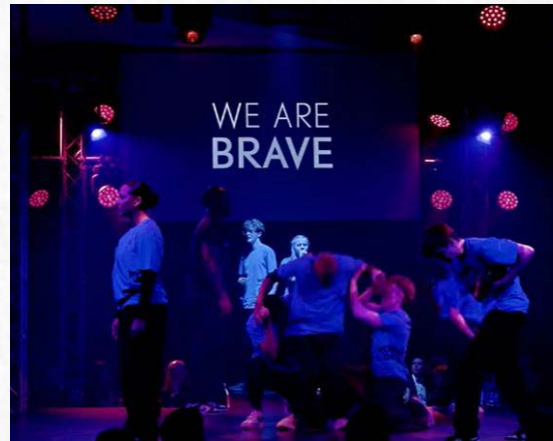
Chickenshed Wonder Gala