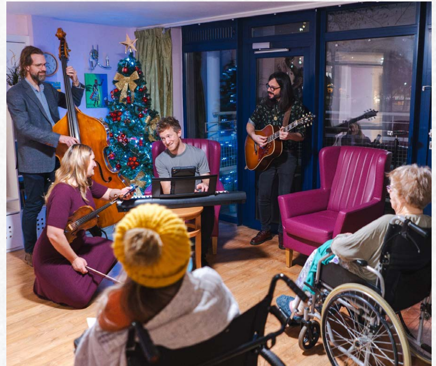
Tech Belt Community Fund recipient – The Spitz