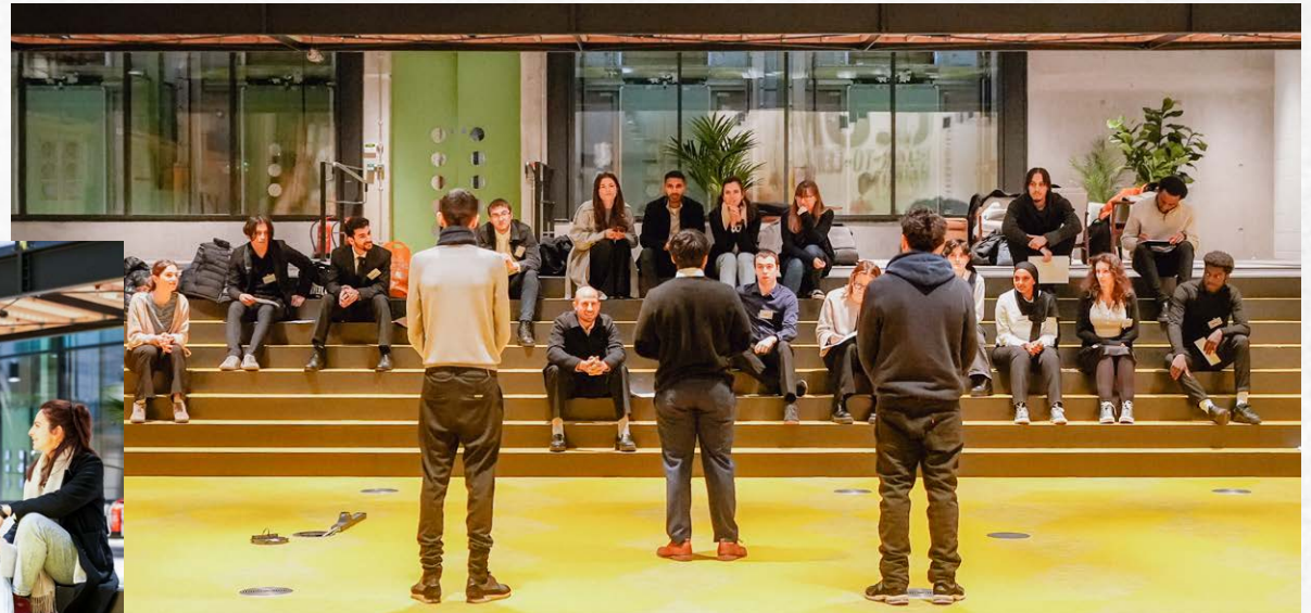
Resurgo's Spear programme