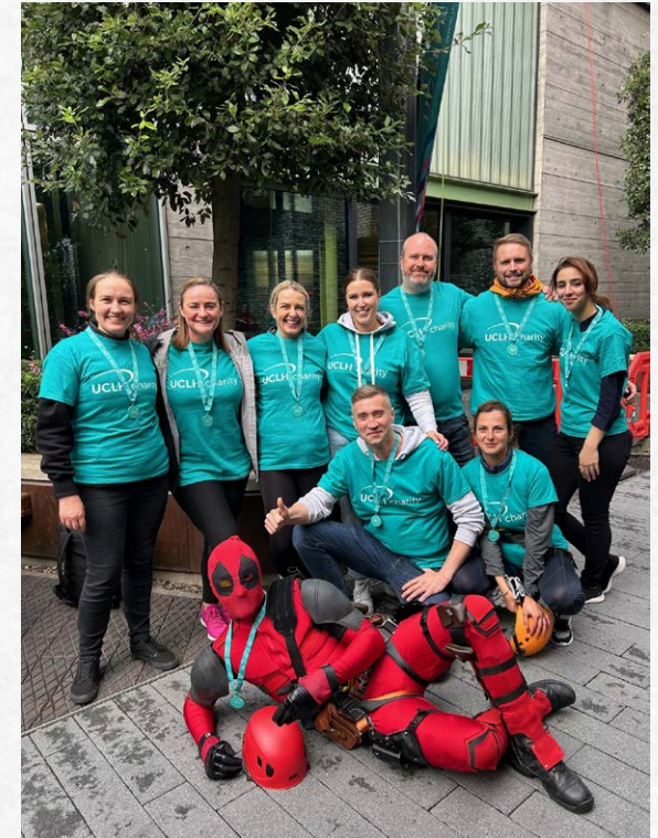
UCLH Charity inaugural abseil fundraiser