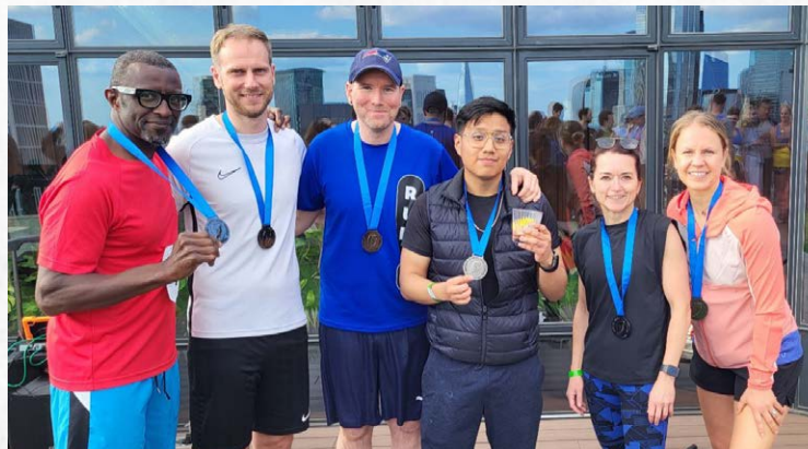
Roof top half marathon and team medals