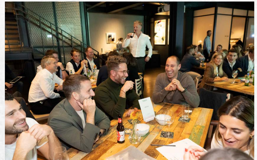
The Story of Christmas pub quiz fundraiser