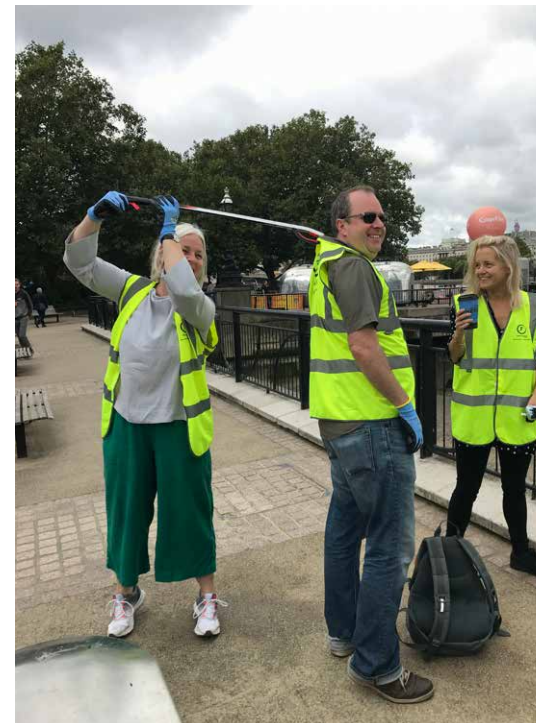
↑ Beach clean along the River Thames in conjunction with Paper Round