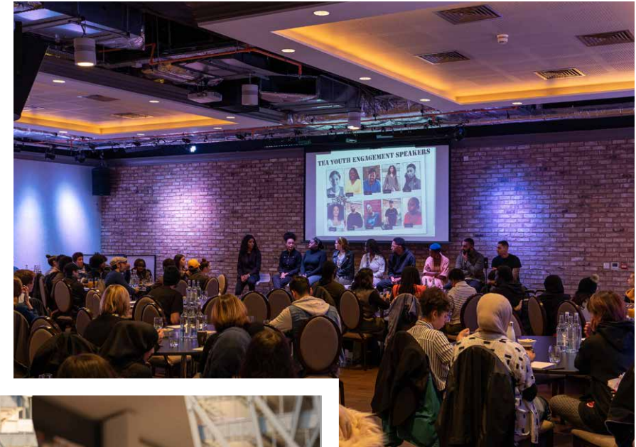
↑ Youth engagement day at Tea Building

Our building teams have opened their doors and welcomed primary schools in, they have invited secondary schools to our buildings to meet not only us but the architects and construction companies who are instrumental to our buildings, and we hosted our first ever careers carousel in collaboration with our occupiers.