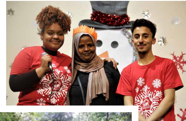
← Fitzrovia & West End Fund 2019 – Fitzrovia Youth in Action's community Christmas lunch