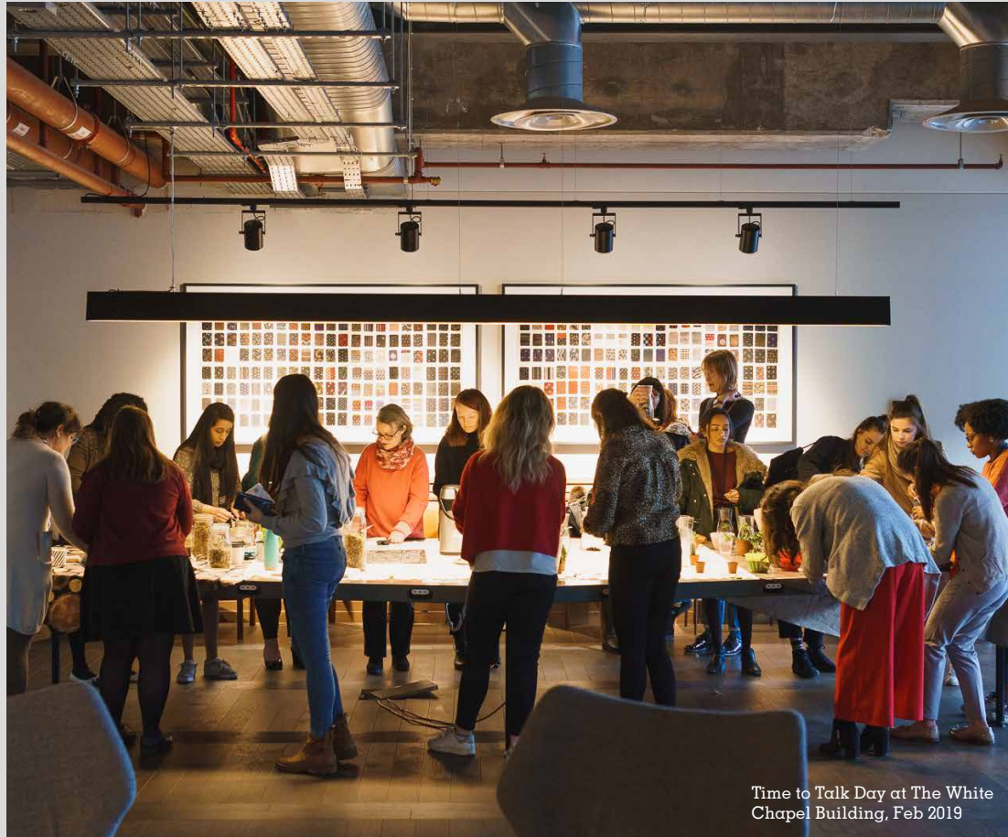
Time to Talk Day at The White Chapel Building, Feb 2019

2019 was yet another busy year for us. Broadening the reach of our Fitzrovia & West End Community Fund has brought with it new introductions and brand new opportunities to connect.