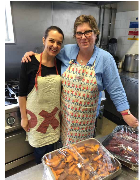
↑ Our longstanding commitment to the Soup Kitchen remains strong

"A really worthwhile cause. I will definitely sign up again!"