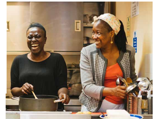
↑ Migrateful Chefs training programme for refugees and migrants Tech Belt Fund 2021