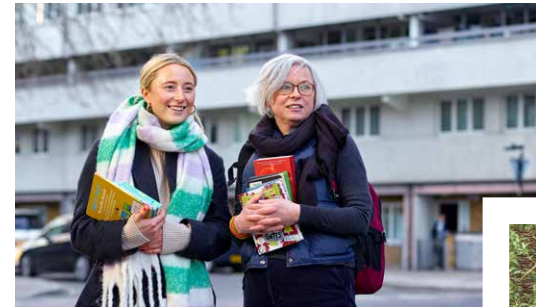
← The Doorstep Library Doorstep reading project Fitzrovia & West End Fund 2021