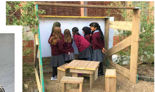
↑ Global Generation Nature Explorers After School Club Tech Belt Fund 2021