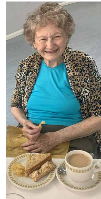
↑ All Souls Serve the City Seniors lunch club reopens for in person events after being closed during lockdown Fitzrovia & West End Fund 2021