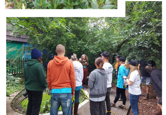
↑ School grounds maintenance day at King Solomon Academy

“It’s been an absolute pleasure taking part in the Writing Partners scheme with the year 6 children. I have really enjoyed reading my letters and I wish them all the best for secondary school”