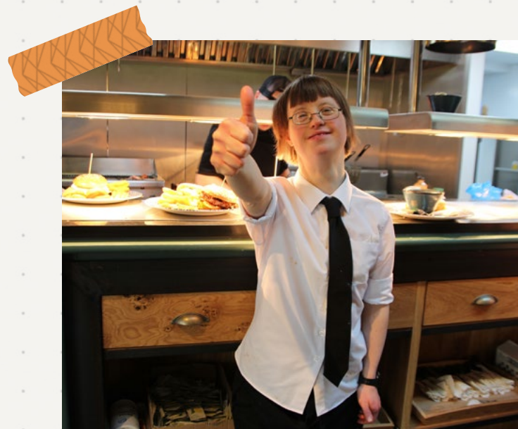
Community Fund East recipient – Action for Kids

In total in 2025, £154,163 was awarded to 20 projects across the two Funds.