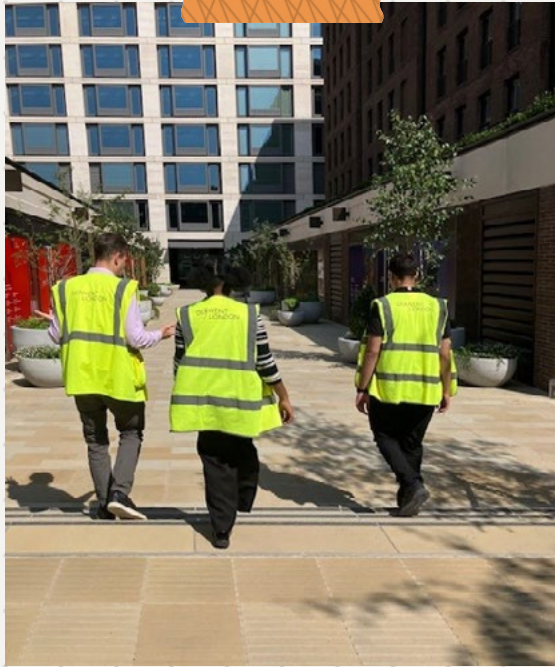
Empowering young people through the EY Foundation