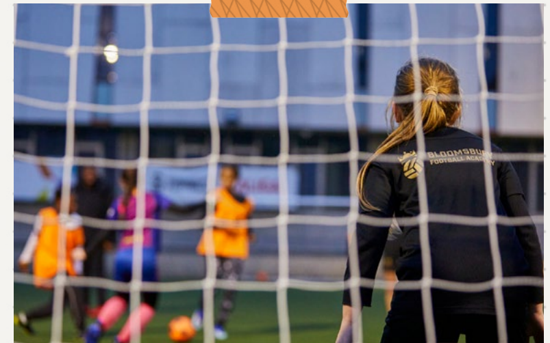
Community Fund West recipient – Bloomsbury Football Foundation