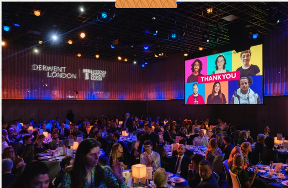
Teenage Cancer Trust Lunch 2025