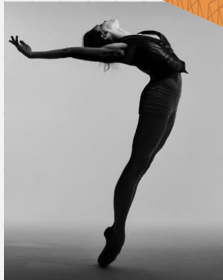
Celebrating arts and culture with Sadler's Wells

The Sponsorship & Donations Committee continued its strong support for communities by ensuring ongoing commitment for vital causes.