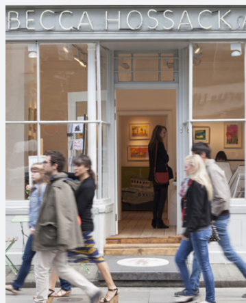
REBECCA HOSSACK GALLERY, 28 CHARLOTTE STREET, W1