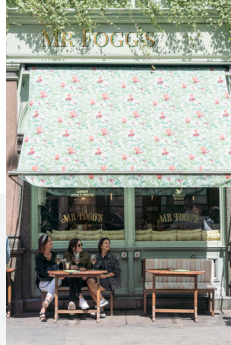
MR FOGGS, 48 NEWMAN STREET, W1