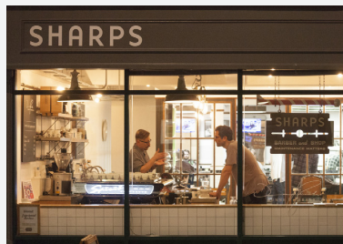
SHARPS, 9 WINDMILL STREET, W1