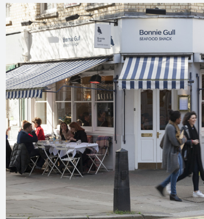
BONNIE GULL SEAFOOD SHACK, 21A FOLEY STREET, W1

THIS HISTORIC ARTISAN DISTRICT BRINGS ITS ECLECTIC STORY TO THE FORE WITH A MIX OF ARCHITECTURAL STYLES, WIDE STREETS MINGLING WITH COSY SIDE ALLEYS AND AN ABUNDANCE OF HIDDEN BAR AND RESTAURANT GEMS.