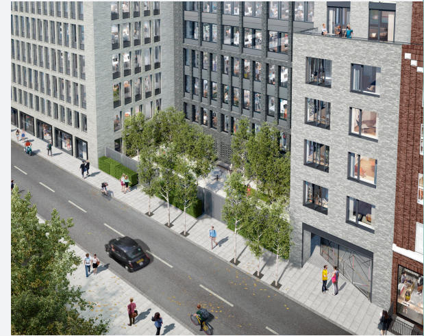
Poet's Park - Chitty Street