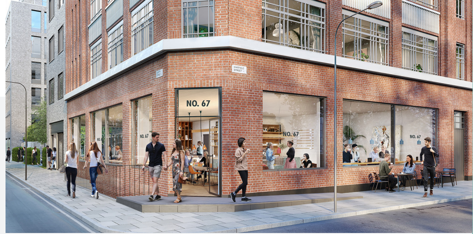
67 Whitfield Street proposed café

DERWENT LONDON ARE PROUD TO CALL FITZROVIA ONE OF THEIR KEY VILLAGES WITH 1.4M SQ FT OF OFFICE AND RETAIL SPACE. THIS MEANS THAT WE CAN OFFER ANY LOCAL COMPANY THE OPPORTUNITY TO HAVE THEIR OFFICE NEEDS MET AS THEIR BUSINESS NEEDS CHANGE.