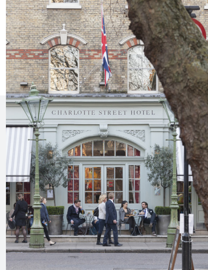
CHARLOTTE STREET HOTEL, 15-17 CHARLOTTE STREET, W1