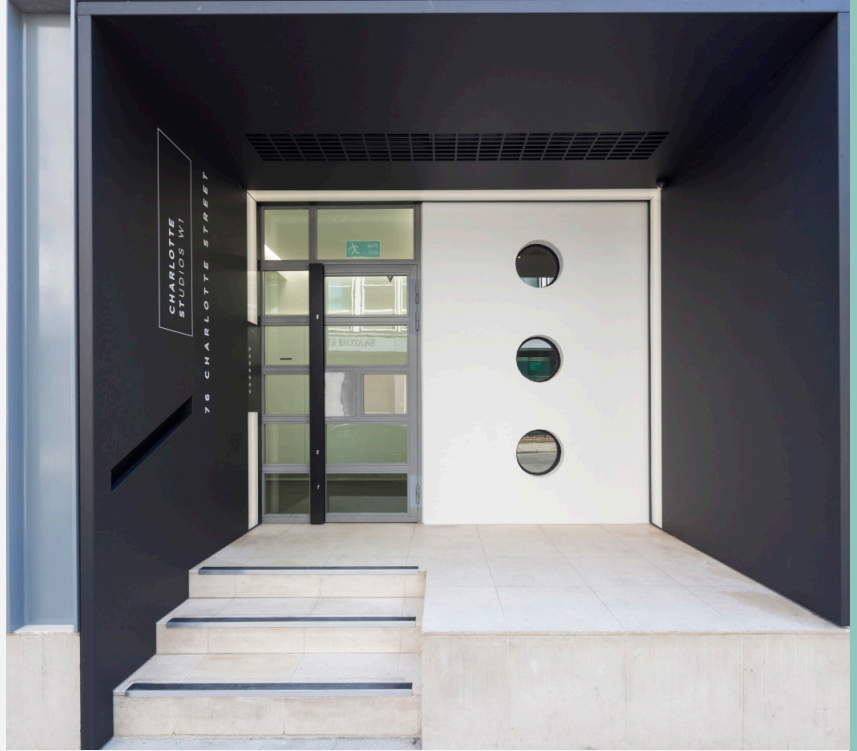
Charlotte Studios entrance

THIS FULLY FITTED AND READY TO GO FLOOR WILL PROVIDE A UNIQUE AND DESIRABLE WORKING ENVIRONMENT FOR ANY ASPIRING BUSINESS.