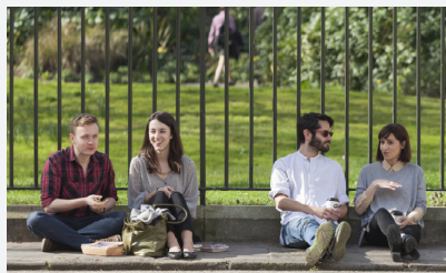
FITZROY SQUARE, W1