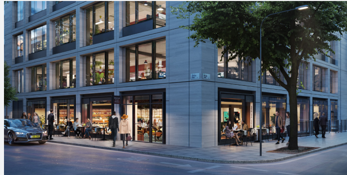
89 Whitfield Street proposed restaurant

THIS IS OUR LATEST DEVELOPMENT, ADJACENT TO 76 CHARLOTTE STREET. IT WILL OFFER TWO NEW EXCITING RETAIL/RESTAURANT UNITS AND THE NEW POET'S PARK, AN URBAN OASIS FOR CENTRAL LONDON, RIGHT ON YOUR DOORSTEP.